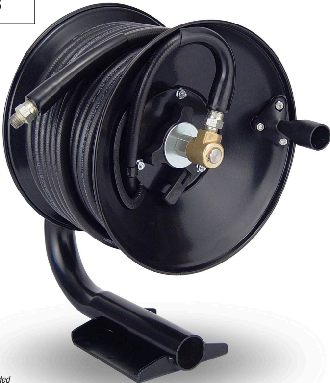
Hose not included Tubular Base sold separately